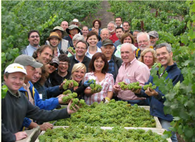
Pick perfectly ripe fruit during the Fall Camp