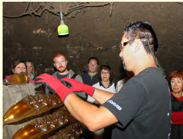
Learn the art of riddling sparkling wines