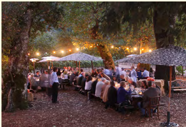
Fall Camp welcome dinner in our J. Davies Vineyards