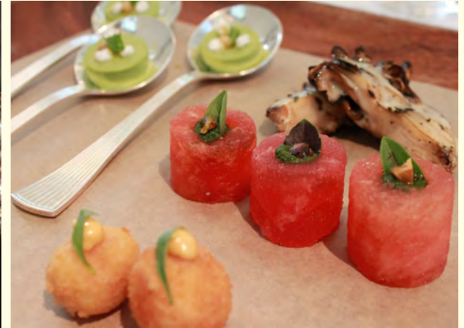
Dive into the science of food & sparkling wine pairings