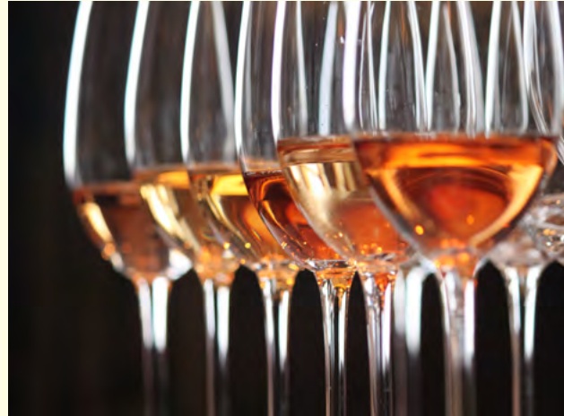
Create your own blend during the Spring Camp session