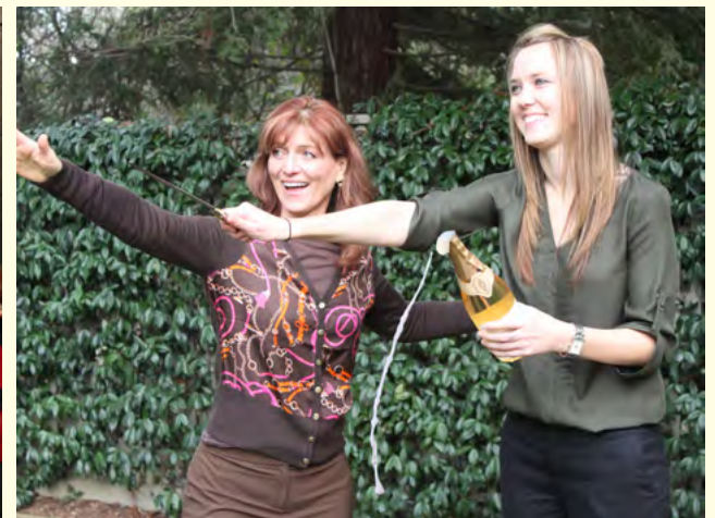
Experience sabering bottles open