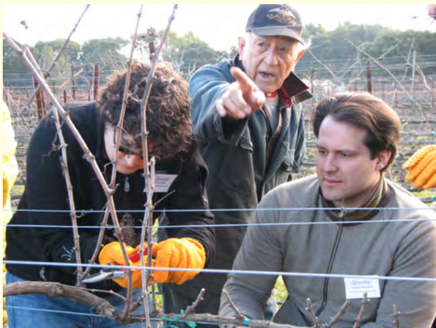
Spring Camp offers hands on pruning techniques